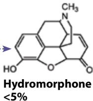
Figure 3-3. Metabolic pathways of morphine. Morphine is primarily excreted in the urine as glucuronide and sulfate conjugates. Small amounts of hydromorphone (<5% of the total morphine concentration) have been observed after administration of morphine in high doses (typically >150 mg/day for females and >200 mg/day for males). 19